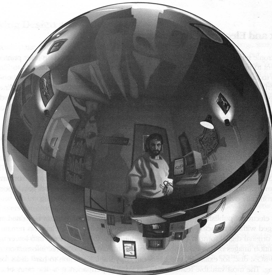
Fig. 1.3. The illustration “Lucid Beginnings” by Michael Scaramozzino was sketched, rendered, and produced on the Macintosh using various painting and drawing programs (courtesy of DreamLight). Copyright © 1989 DreamLight Inc.

Macintosh painting and drawing programs are popular with free-style painting and artwork because the programs are easy to learn and very flexible, and digital graphics can be copied and altered to fit any shape or context. These programs also are used by commercial artists, designers, architects, and engineers because they offer greater precision than hand tools, perfect geometric shapes, and graphic objects that can be moved, transformed, and cloned, as well as grouped with other objects (see fig. 1.3).